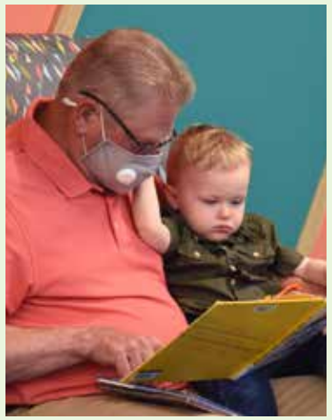
Plenty of seating areas.

On Wednesday, June 2 the new $6.5 million full-service Eureka Hills Branch opened to the public. The new branch is located at 500 Workman Road in Eureka, Missouri. The new branch replaces the former Eureka Hills Branch, located at 156 Eureka Towne Center. Learn more about the new branch by visiting: slcl.org/content/building-projects-eureka-hills-branch