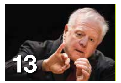
Mingle with Leonard Slatkin