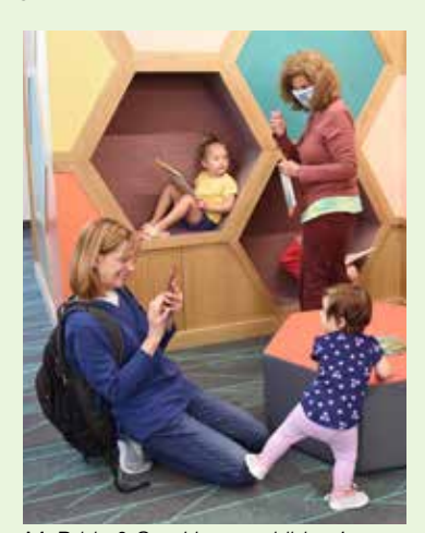
McBride & Son Homes children's area.