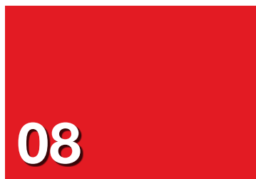
08 New and Renewing Friends