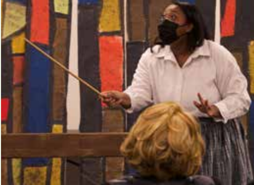
The Black REP performed at Florissant Valley Branch.