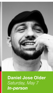
Daniel Jose Older Saturday, May 7 In-person