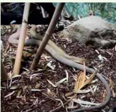
Animal Magic presented virtually by the Saint Louis Zoo.