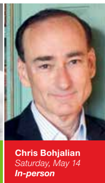
Chris Bohjalian Saturday, May 14 In-person