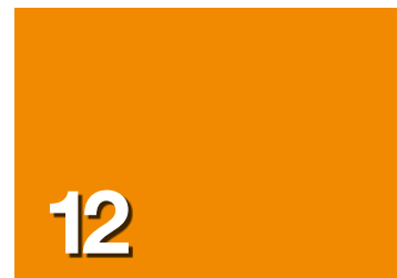
12 Upcoming Author Events