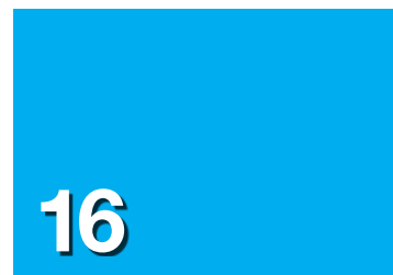
16 Upcoming Author Events