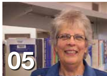
05 Focus on Friends