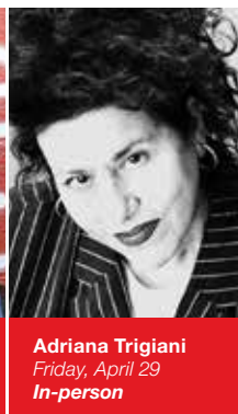
Adriana Trigiani Friday, April 29 In-person