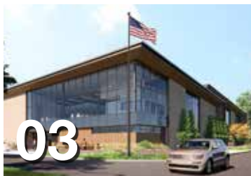
03 Ladue Branch to Commence