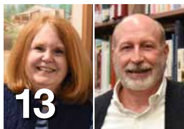
13 Cherished Staff Retire