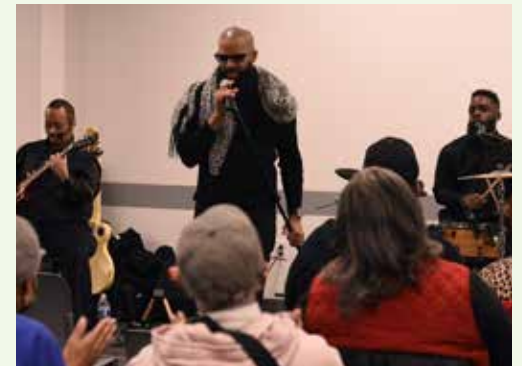
Set the Night to Music was back with the melodic sounds of the Love Jones the Band at the Florissant Valley Branch.