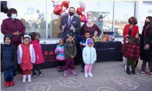
The Library kicked off a new partnership with St. Louis Urban League at their Jennings Head Start Location to provide readalong books to help improve literacy skills. The partnership is made possible by a grant from Citi.