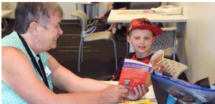
Oasis Intergenerational Tutoring

The Saigh Foundation provided $5,000 in grant funding to support literacy tutoring at SLCL. In partnership with Oasis Intergenerational Tutoring, older adults are paired with children in grades K-3 as their tutors, mentors, and friends. Tutors use a 6-step literacy approach that emphasizes improved speaking, listening, reading, and writing. Originally intended to be in-person tutoring, the service is currently offered virtually using Zoom.