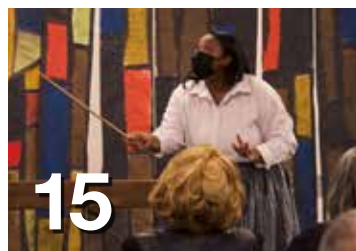
15 Library Happenings