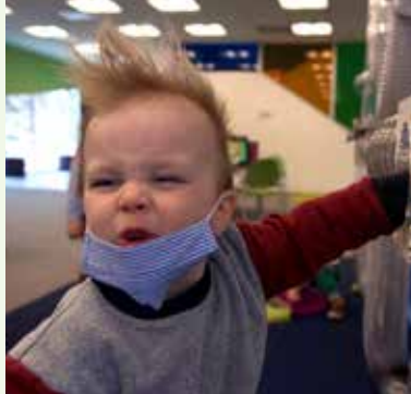
Daniel Boone Discovery Zone fun.