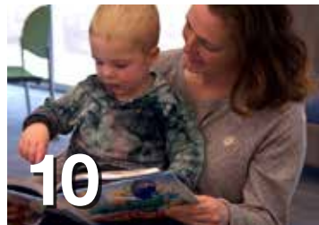
10 SLCL Ranked 4-Stars