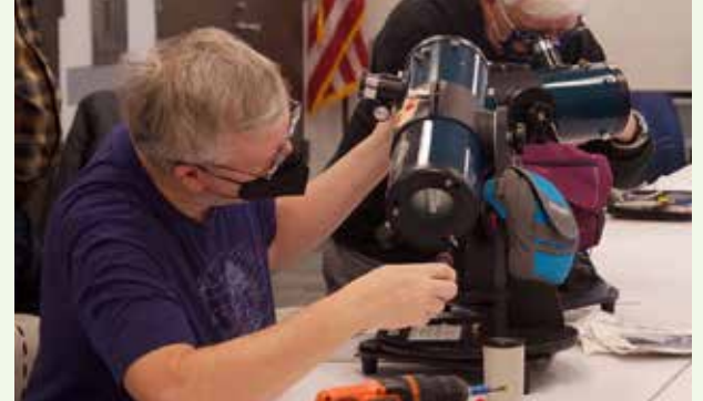
Telescope repair by the St. Louis Astronomical Society at the Oak Bend Branch.