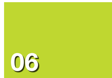
06 From the Stacks