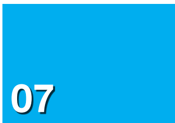
07 Readers' Advisory for Spring